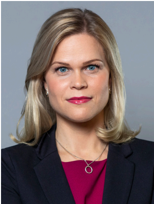
Paulina Brandberg (L) Minister for Gender Equality and Working Life Ministry of Employment