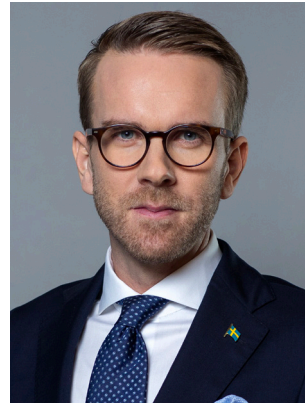
Andreas Carlson (KD) Minister for Infrastructure and Housing Ministry of Rural Affairs and Infrastructure