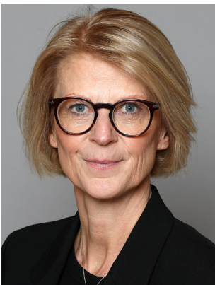
Elisabeth Svantesson (M) Minister for Finance Ministry of Finance