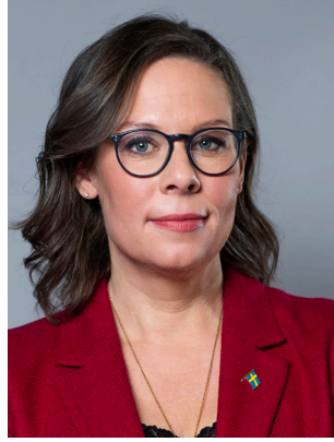
Maria Malmer Stenergard (M) Minister for Migration Ministry of Justice