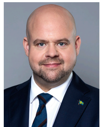
Peter Kullgren (KD) Minister for Rural Affairs and Infrastructure Ministry of Rural Affairs and Infrastructure