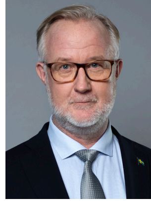
Johan Pehrson (L) Minister for Employment and Integration Ministry of Employment