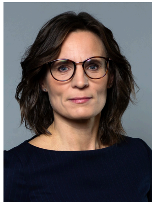
Jessika Roswall (M) Minister for EU Affairs Prime Minister's Office