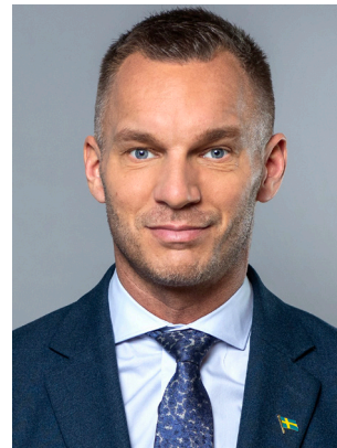
Erik Slottner (KD) Minister for Public Administration Ministry of Finance