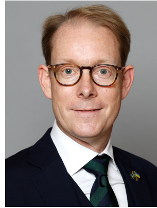
Tobias Billström (M) Minister for Foreign Affairs Ministry for Foreign Affairs