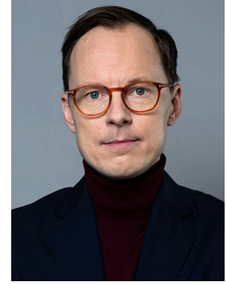
Mats Persson (L) Minister for Education Ministry of Education and Research