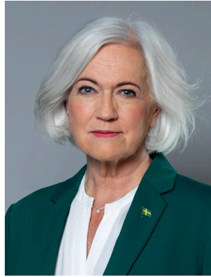
Acko Ankarberg Johansson (KD) Minister for Health Care Ministry of Health and Social Affairs