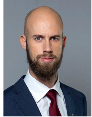
Carl-Oskar Bohlin (M) Minister for Civil Defence Ministry of Defence