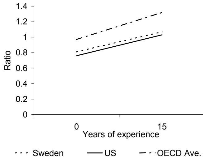
Figure 2. Ratio of teacher salary to GDP per capita

Absolute levels of teacher salaries are low in both Sweden and the US. In 2002, the average salary in education in Sweden was USD 28,500 overall for teachers in the municipal sector, which accounts for the bulk of employees. This is 99 percent the salary earned by secretaries and 75 percent that of police working for the central government. In fact, teachers in Swedish primary education only earn 13 percent more than housekeepers employed by the municipal sector. 16 The average public school teacher in Sweden receives about 82 percent the salary of the average Swedish worker who has at least two years of college but less than a doctorate. Thus, teacher salaries are well below that of individuals with comparable training and skill. Of course, teachers do not work a full year, and part of the pay differentiation reflects shorter hours of work. But, in the US, teachers work only 6.5 percent fewer hours than the typical college graduate, and their pay is 36 percent less than the average college graduate, based on data from 2001. 17