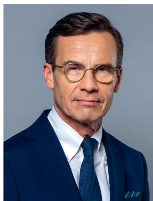
Ulf Kristersson (M) Prime Minister Prime Minister's Office