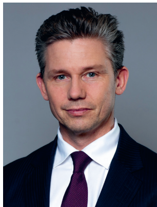
Pål Jonson (M) Minister for Defence Ministry of Defence