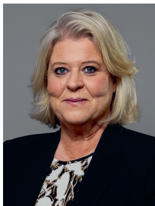
Camilla Waltersson Grönvall (M) Minister for Social Services Ministry of Health and Social Affairs