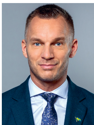
Erik Slottnér (KD) Minister for Public Administration Ministry of Finance