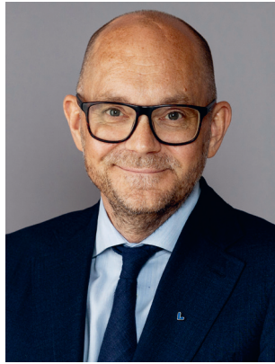
Johan Britz (L) Minister for Employment Ministry of Employment