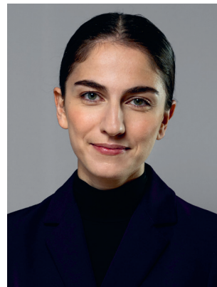
Romina Pourmokhtari (L) Minister for Climate and the Environment Ministry of Climate and Enterprise