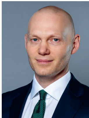
Niklas Wykman (M) Deputy Minister for Finance, Minister for Financial Markets Ministry of Finance