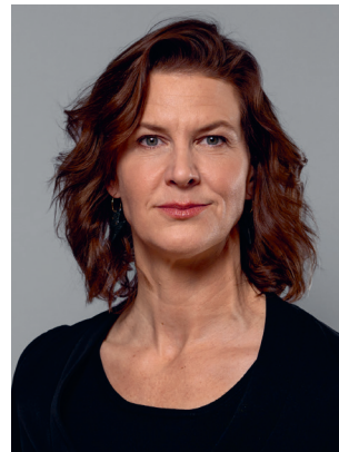
Nina Larsson (L) Minister for Gender Equality Ministry of Employment