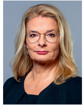
Lotta Edholm (L) Minister for Upper Secondary School, Higher Education and Research Ministry of Education and Research