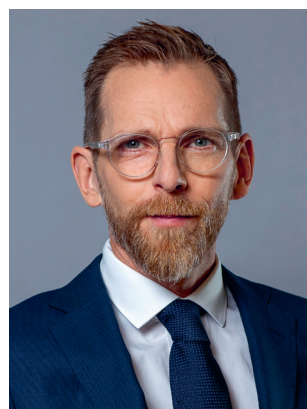
Jakob Forssmed (KD) Minister for Social Affairs and Public Health Ministry of Health and Social Affairs