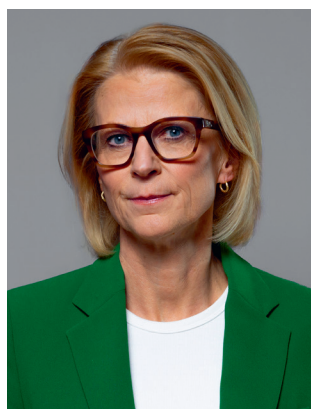
Elisabeth Svantesson (M) Minister for Finance Ministry of Finance