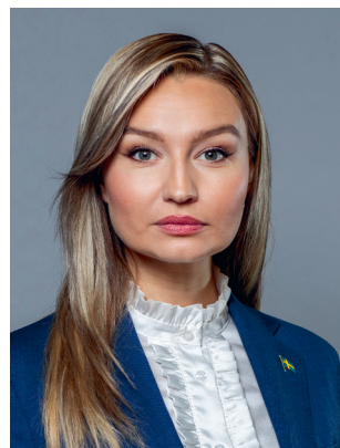
Ebba Busch (KD) Minister for Energy, Business and Industry and Deputy Prime Minister Ministry of Climate and Enterprise