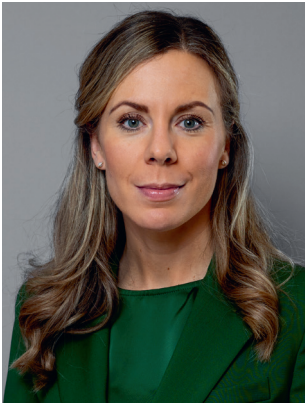
Jessica Rosencrantz (M) Minister for EU Affairs Prime Minister's Office