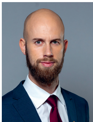
Carl-Oskar Bohlin (M) Minister for Civil Defence Ministry of Defence