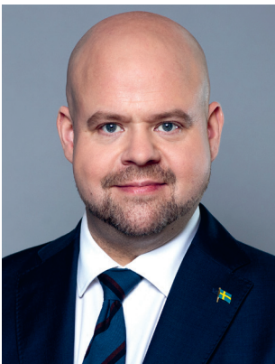
Peter Kullgren (KD) Minister for Rural Affairs Ministry of Rural Affairs and Infrastructure