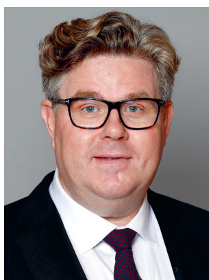
Gunnar Strömmer (M) Minister for Justice Ministry of Justice