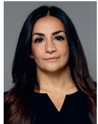
Parisa Liljestrand (M) Minister for Culture Ministry of Culture