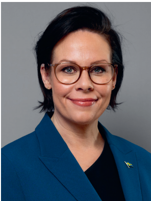
Maria Malmer Stenergard (M) Minister for Foreign Affairs Ministry for Foreign Affairs