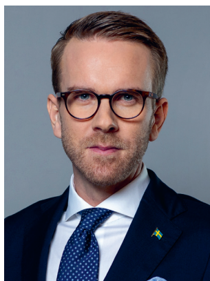
Andreas Carlson (KD) Minister for Infrastructure and Housing Ministry of Rural Affairs and Infrastructure