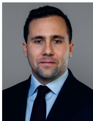
Benjamin Dousa (M) Minister for International Development Cooperation and Foreign Trade Ministry for Foreign Affairs