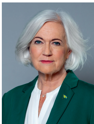
Acko Ankarberg Johansson (KD) Minister for Health Care Ministry of Health and Social Affairs