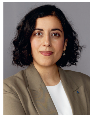
Simona Mohamsson (L) Minister for Education and Integration Ministry of Education and Research

Sweden is governed by the Moderate Party (M), the Christian Democrats (KD) and the Liberals (L). On 18 October 2022, a government took office with Ulf Kristersson (M) as prime minister.