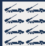
Archer Artillery System