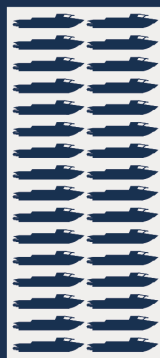
Combat Boat CB90