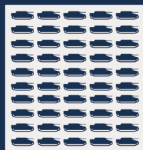
Combat Vehicle CV90