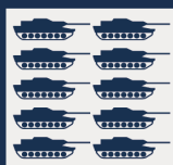
Leopard 2 Main Battle Tank