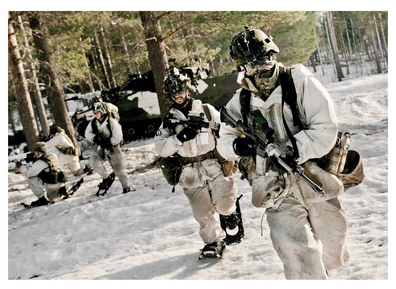
100 Danish soldiers from the Jutland Dragoon Regiment acted as the enemy in the exercise Vintersol. • Photo: Jimmy Croona/ Swedish Armed Forces

"We plan to develop Nordic cooperation through bilateral agreements and present a new concept of Nordic cooperation, through easy access declarations."