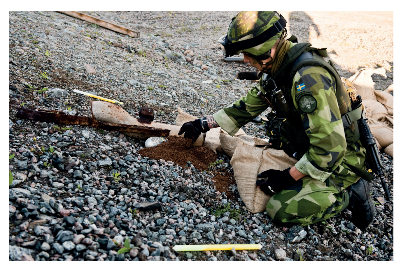
Bomb disposal during the exercise SWENEX.