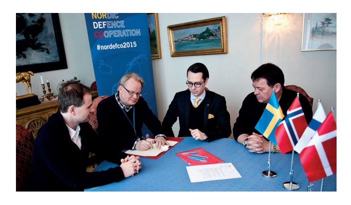
During the Defence Ministerial in March 2015, the Ministers signed the Agreement concerning support for industry cooperation in the defence material area.

The Nordic Ministers and Cheifs of Defence have for several years worked to strengthen and develop Nordic cooperation on air surveillance. Exchange of data on air surveillance will facilitate for improved situational awareness in the