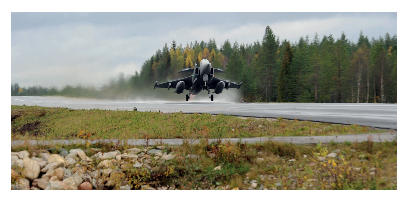
In September 2015, two F-18 Hornet from the Finnish Air Force and two JAS 29 Gripen from Norrbotten Air Force Wing landed on a Finnish highway strip and then conduted a joint training mission within the framework of Cross Border Training.